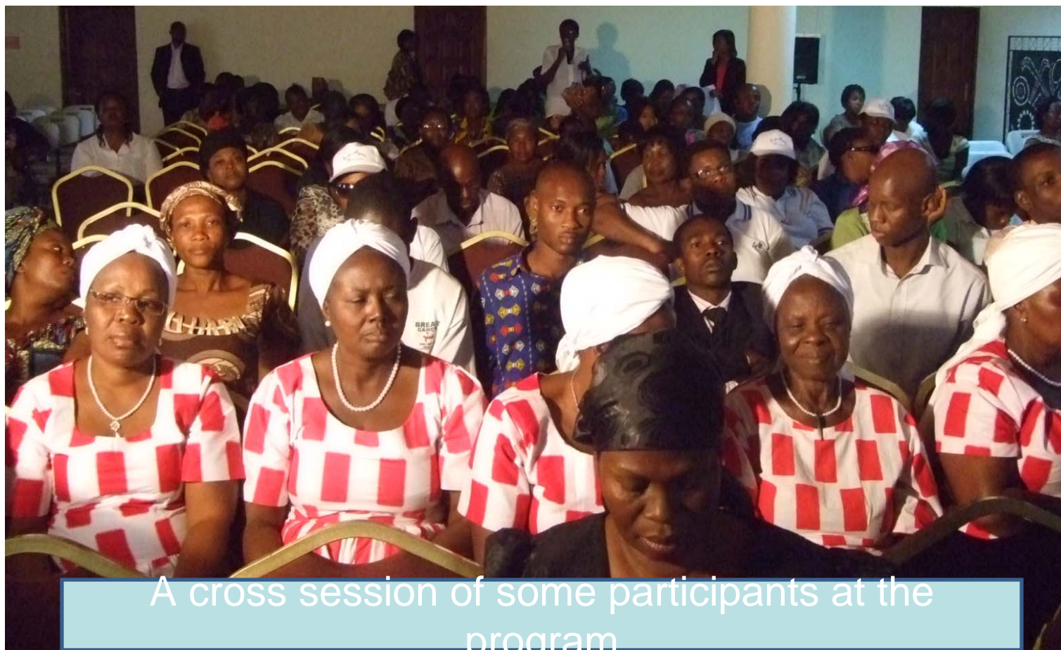
A cross section of some participants at the program