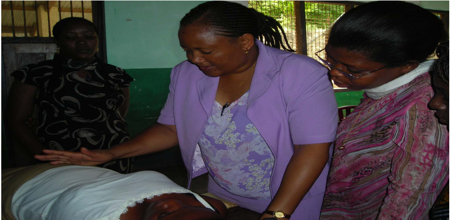
Surgeon teaching other MEWATA Doctors on Breast Clinical Examination