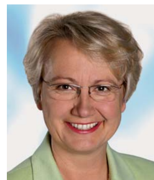
Dr. Annette Schavan Federal Minister of Education and Research