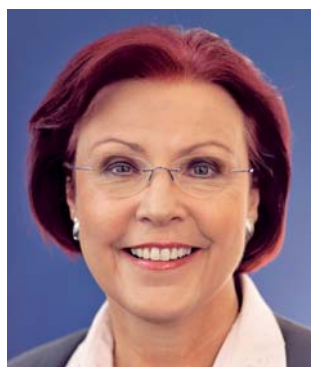
Heidemarie Wieczorek-Zeul Federal Minister for Economic Cooperation and Development