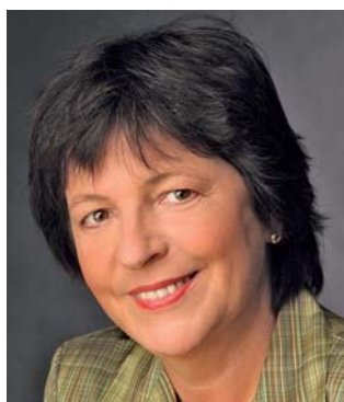
Ulla Schmidt Federal Minister of Health