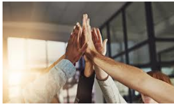
Illustration of hands going for a high five as a group or team