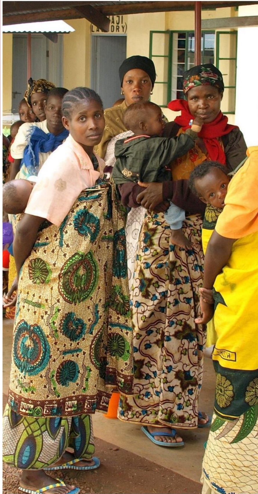
© 2008 Niemi Ritva, Courtesy of Photoshare, Tanzania

SCHOOL OF PUBLIC HEALTH Women and Health Initiative