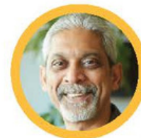
Vikram Patel, PhD, MBBS

of the Program in Global Mental Health and Social Change, Harvard Medical School Associate Director of the Chester M. Pierce, MD Division of Global Psychiatry, Massachusetts General Hospital Director of Mental Health, Partners In Health