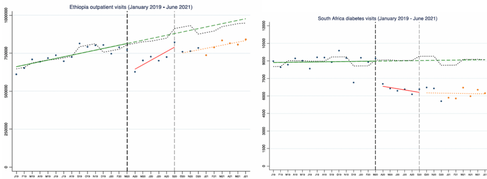
Fig 1., Trends in total outpatient visits in Ethiopia countries from January 2019 to December 2020. (Fig., 2, shows the same trends in South Africa)