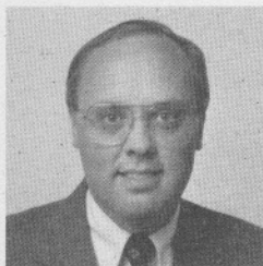
John D. Graham Center Director