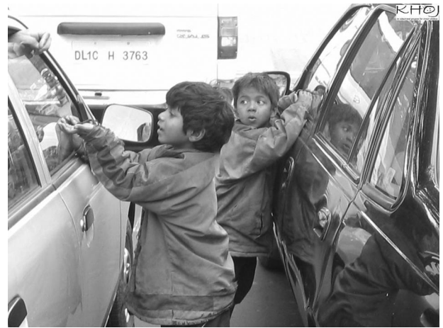
Children beg from drivers stopped at a traffic signal in India.

Recall that epidemiologic data had clearly shown that the absolute risk of breast cancer was higher than that of cardiovascular disease among perimenopausal women, particularly among the great majority who were nonsmokers. 44,53 Thus, recommendations for hormone therapy effectively asked these women to increase their short-term and not inconsiderable risk of cancer, with the hope of decreasing their long-term risk of cardiovascular disease. 44,53 The trade-off has been costly. Studies conducted between 2002 and 2005 in the United States, United Kingdom, Australia, and Norway suggest that hormone therapy accounts for somewhere between 10 and 25% of observed breast cancer cases. 54–57 In the United Kingdom, this has been estimated to translate to an extra 20,000 breast cancers among women ages 50–64 in the past decade alone. 54 New results, moreover, using post-WHI cancer registry data, indicate that between 2002 and 2003, US breast cancer rates fell by 7–11%, with this extraordinary decline especially evident among the types of breast cancer most linked to hormone therapy, ie, estrogen-receptor positive tumors among postmenopausal women. 58–61 If, as suspected, this drop is shown