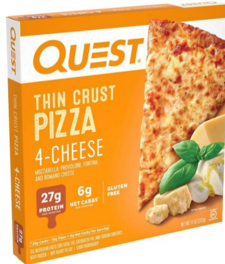
Sold at Target

A recent study has described trends in calories among food items sold in U.S. convenience stores and pizza restaurant chains from 2013 to 2017, the period leading up to the implementation of the federal menu labeling mandate. These businesses were chosen in order to assess whether core food items were reformulated during the study period and because they were openly resistant to implementing menu labeling.