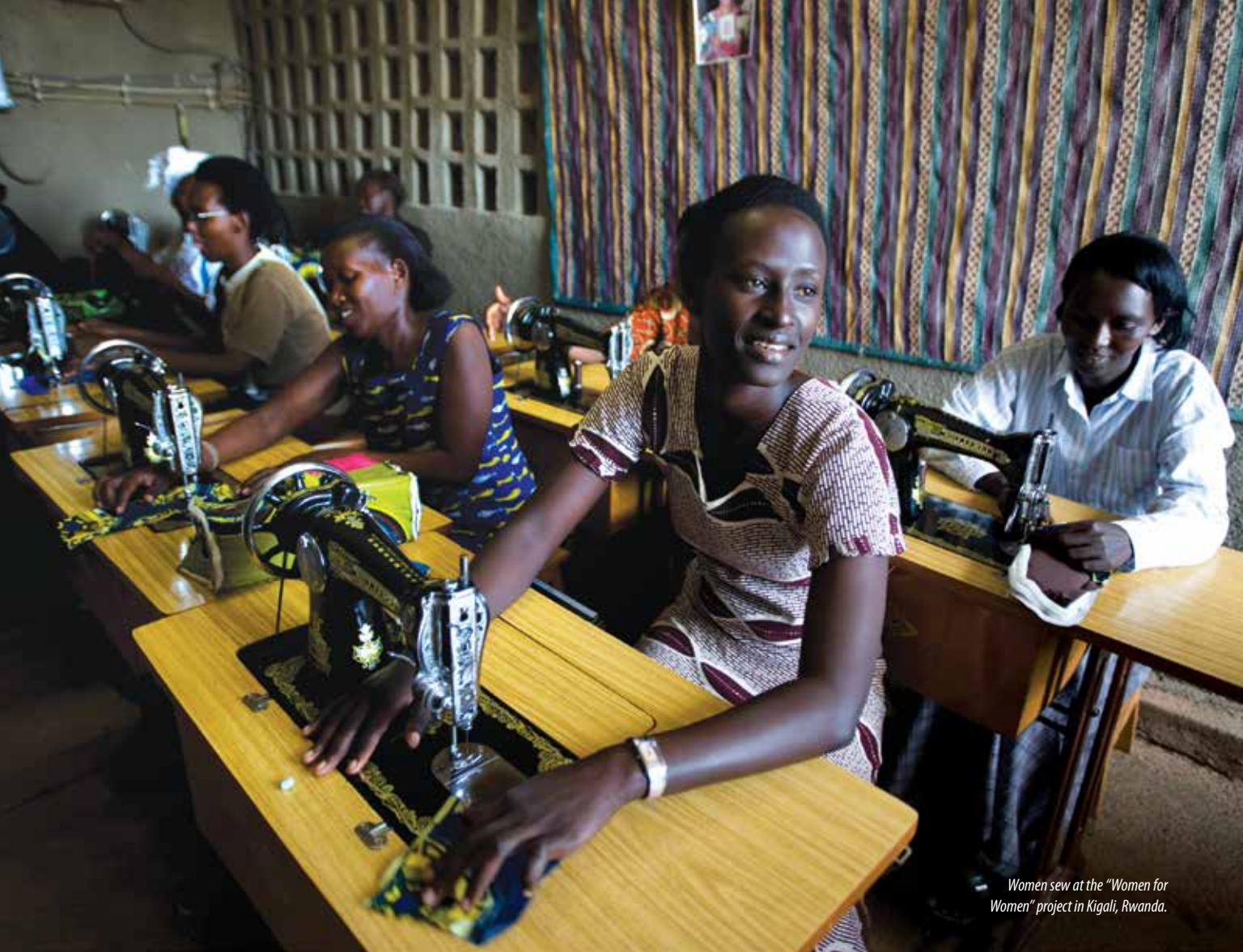
Women sew at the “Women for Women” project in Kigali, Rwanda.