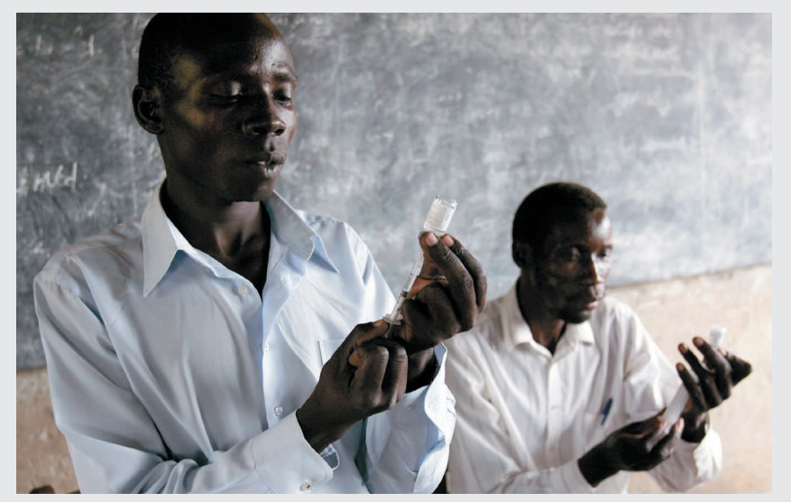
Health workers in Uganda preparing for a meningitis vaccination campaign.

Vaccines are one of the most effective means of improving public health, technically and economically.