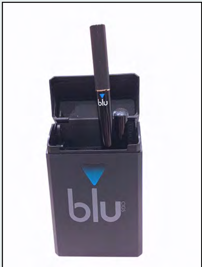
blu eCigs® electronic cigarettes

The Center will also provide a conduit for HSPH students and research fellows wishing to undertake tobacco control research and engage in hands-on training in policy development and implementation. We are also working to enhance the Center's funding base through grant awards and through close collaboration with the Office of External Relations to develop a donor base. Finally, through its public profile, the Center will provide a trusted information resource for national media on issues of tobacco control research and policy.