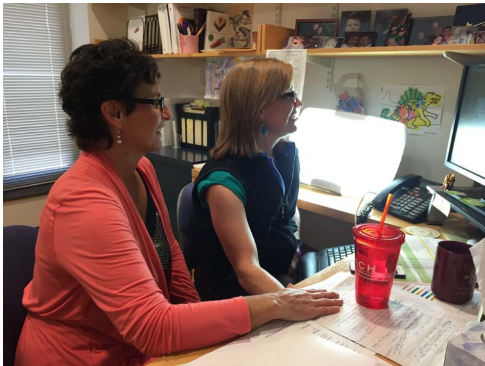
Members of our grants team enjoying a "sunny" moment during their workday