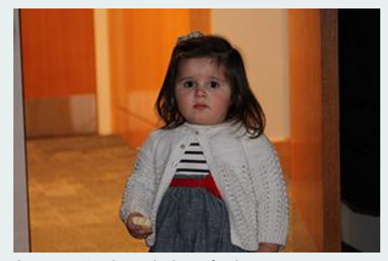
A young attendee enjoying refreshments.