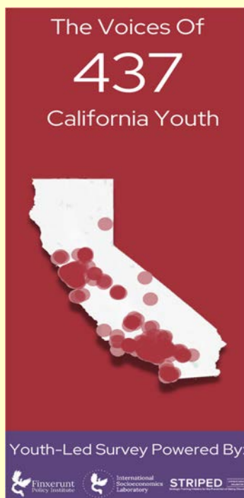
Youth-led statewide survey

Scientists have long been stymied by the gap between the evidence that we generate through our research and policy-makers' decisions about which public health causes to champion. But passionate and courageous young people have a unique role to play in bridging this gap with their powerful stories and insights, borne of their lived experience as teens coming of age today. For the STRIPED Youth Corps, policy advocacy has become an inspiring addition to their after-school extracurriculars.