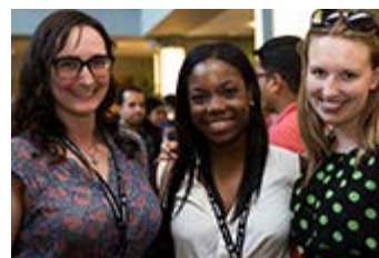
Scenes from Orientation 2014