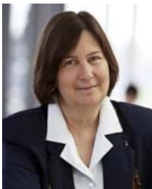
Sciences in Public Health Program.