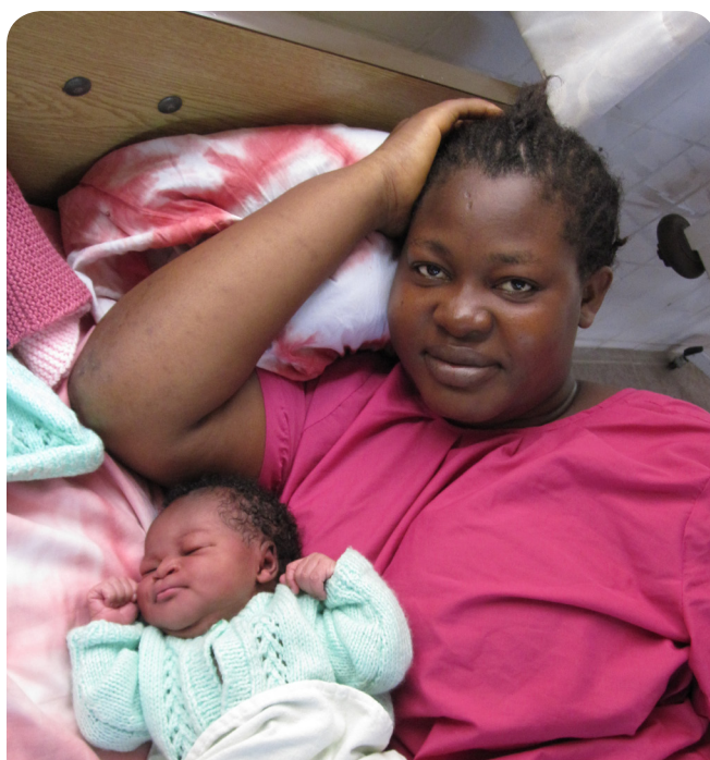
A healthy mother and newborn at the Aberdeen Women's Centre maternity unit

AWC's clinical leaders recognize that increased internal communication before and during the launch of the maternity unit would have helped to ensure a shared, clear understanding of the planned implementation and policies from the inception. Staff turnover between development and implementation was