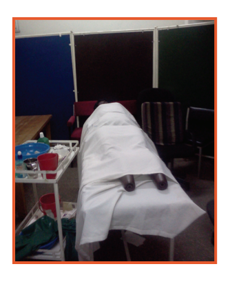
Skills lab set up for a demonstration