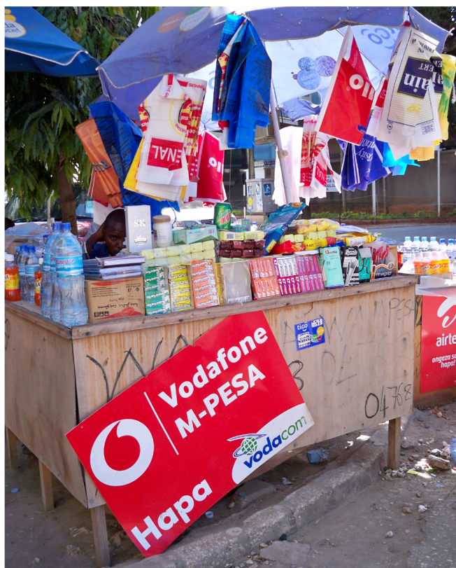
M-PESA services are widely available across East Africa.

Calls came in to the hotline immediately after its launch in July 2009, with more than 40 women being referred to JMh in the first month. People are able