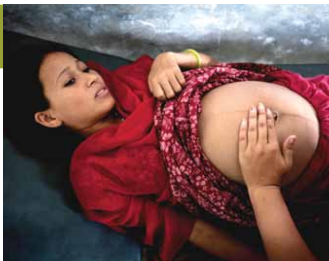
A pregnant woman has her abdomen and unborn fetus examined at a rural health clinic in Hetauda, Makwanpur, Nepal.