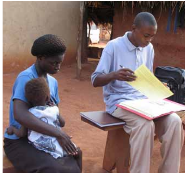
Data collection in Ghana.

For most of the remaining nine core indicators (children under five years of age who are stunted and the eight coverage indicators), the optimal scenario is a combination of high-quality facility reporting — providing annual data by district for sub-national analysis and for planning and programmatic purposes, including at annual health sector reviews — with household surveys. Household surveys and routinely-collected data each have strengths and limitations, and are complementary. Both sources need to be continuously assessed for data quality, and adjustments made