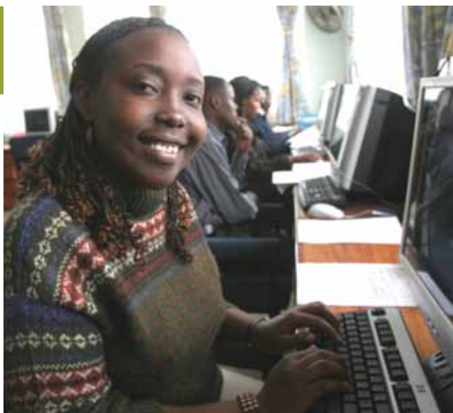
Data manager in Kenya.