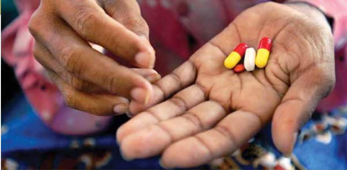
Twenty-nine year old HIV-positive mother holds her cocktail of antiretroviral drugs at a hospital in Pourk District, Siem Reap, Cambodia.