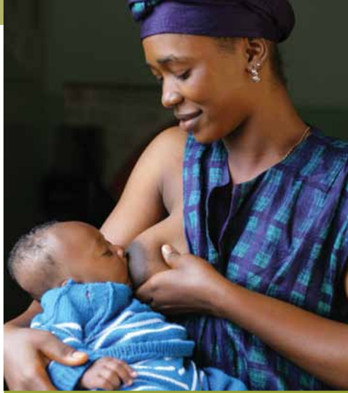
A woman breastfeeds her baby at a district hospital in Makeni, Northern Province, Sierra Leone.