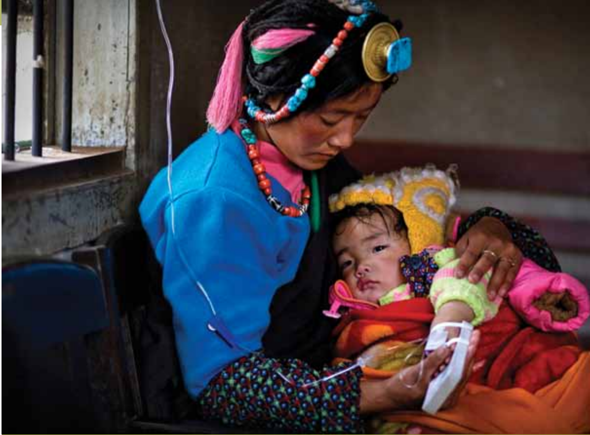
A nomadic Khampa child receives basic medical treatment in a small clinic in Dengke, Sichuan Province, China.