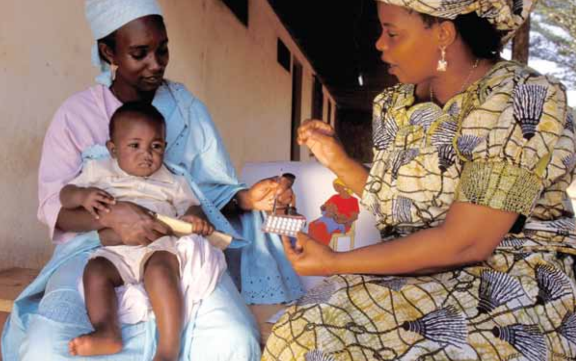
Family planning motivator, North Cameroon.