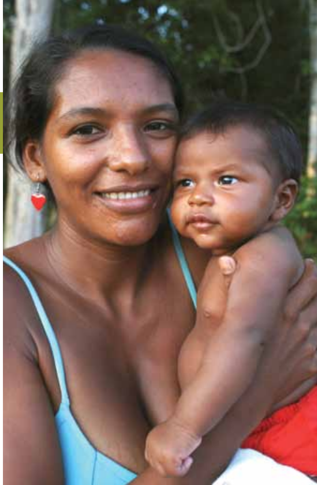
Mother and baby, Para State, Brazil.