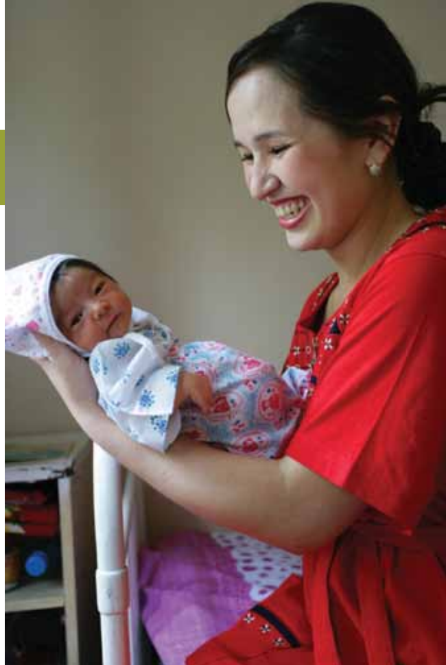
A mother with her newborn baby soon after delivery in the maternity ward of a hospital, Uzbekistan.

countries. 2 The Commission identified 11 core indicators 3 that, taken together, enable stakeholders to track progress in improving coverage of interventions needed to ensure the health of women and children across the continuum of care. These indicators include eight measures of intervention coverage and three measures of impact. For all 11 indicators, the Commission urged that the data be disaggregated by gender and