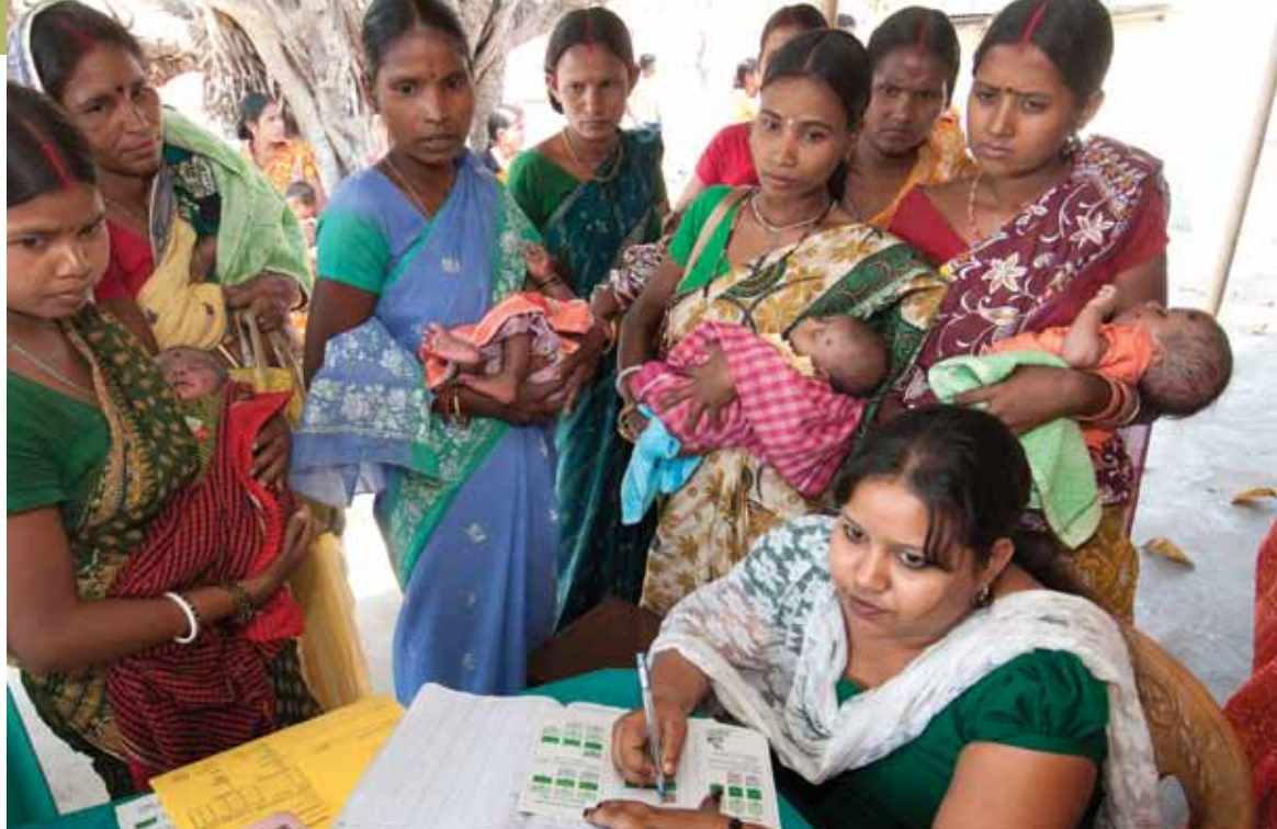
At a health centre in the village of Tirildih, medical workers register women and babies for a maternity check-up and child vaccination, Jharkhand, India.