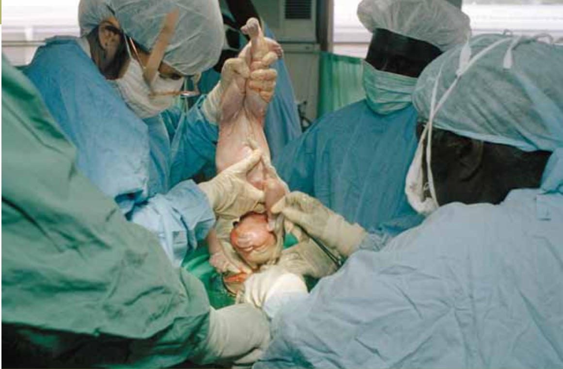
A baby is born by Caesarean section at Helena Goldie Hospital in Munda, New Georgia, Western Province, Solomon Islands.