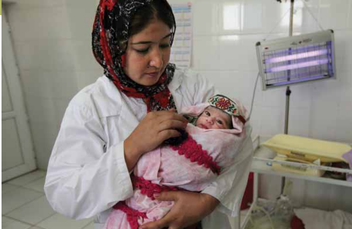
A newborn in the Maternity Unit at the Ahmed Shah Baba Hospital in Kabul, Afghanistan.