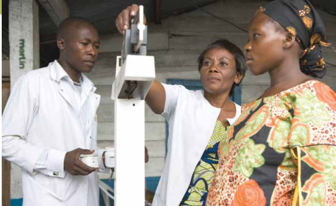
A health worker weighs an internally displaced pregnant woman in Ndosho Health Clinic, Democratic Republic of the Congo.