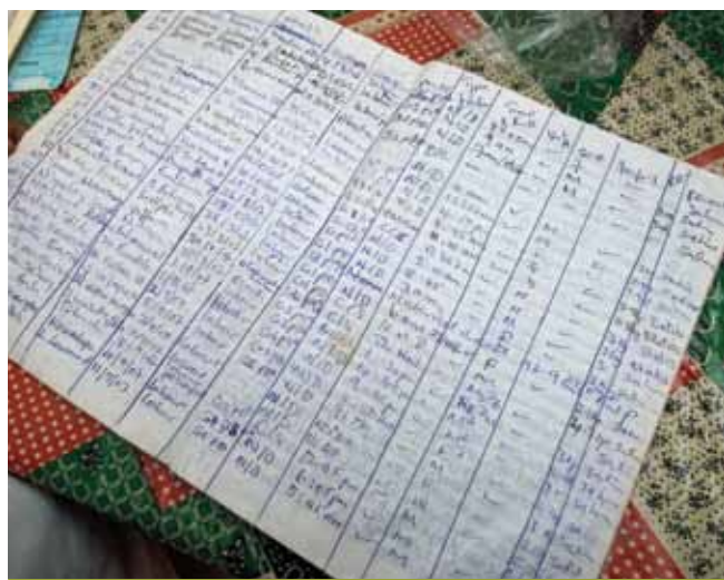
Register of births at the Kabala Maternity Complex, Kabala, Northern Province, Sierra Leone.

Data on child stunting and other nutritional status indicators in low-income countries are drawn mainly from household surveys. All 74 countries have at least one data point since 2000. Twenty-two countries have data points for 2008-09, with most data points from 2008.