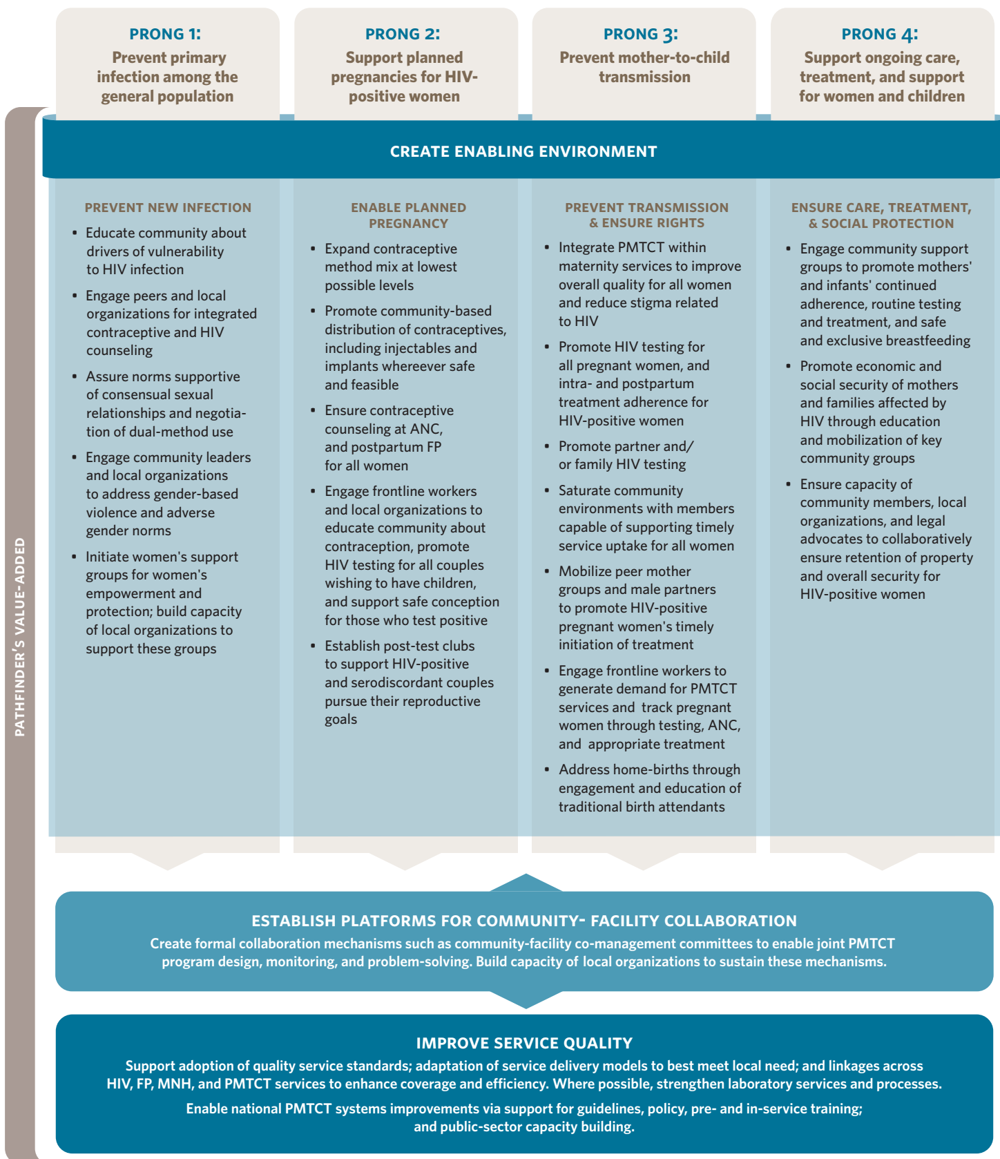
FIGURE 1. THE PATHFINDER GLOBAL PMTCT STRATEGY AS IT BUILDS UPON THE UNITED NATIONS' FOUR PRONGS MODEL