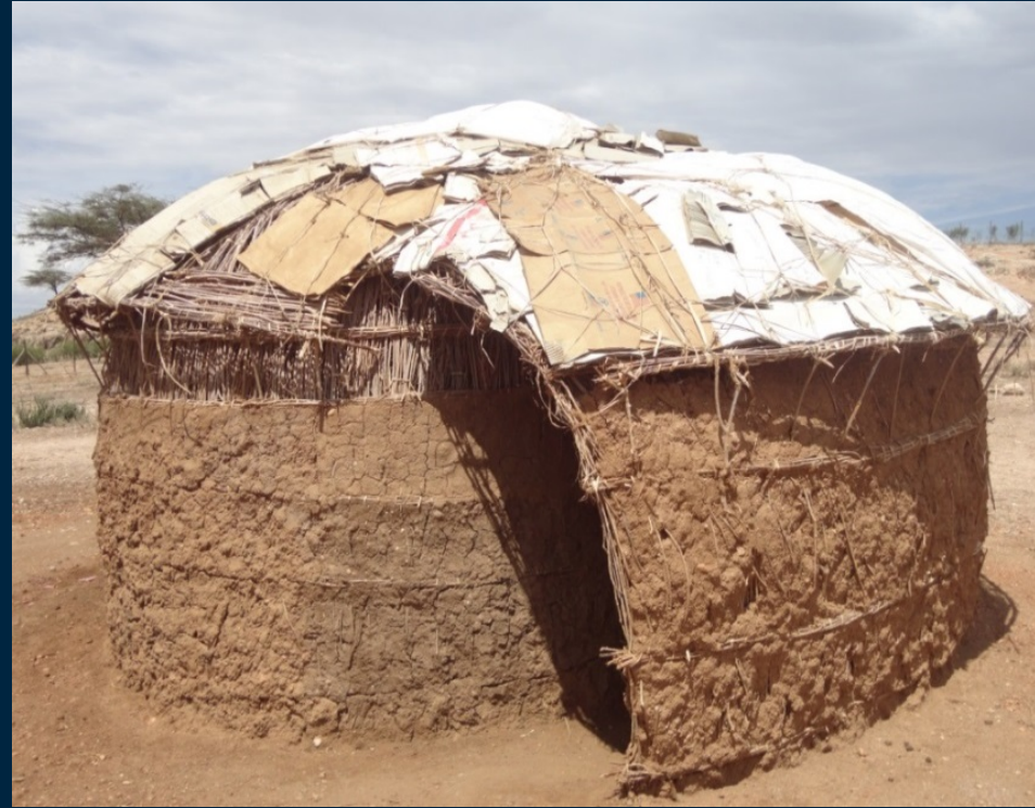
Nachola Mama shelter

In 2013, International Medical Corps supported establishment of Nachola community unit where 30 community health volunteers were trained on nutrition and health components, these volunteers were involved in educating the women on the importance of seeking services of a skilled attendant during birth, as well as strengthening referral systems for malnourished cases, skilled deliveries, immunization and growth monitoring for children.