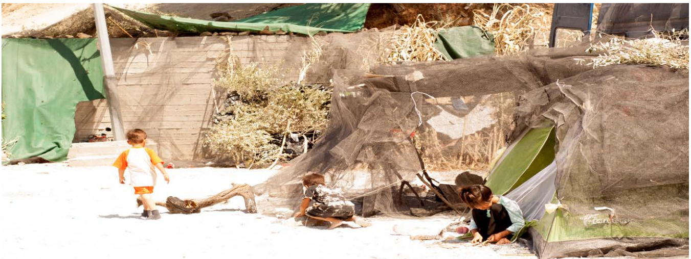
AN AD-HOC FAMILY SHELTER, MORIA.

Port of Mytilene and the City of Mytilene. With camps unable to contain the growing number of migrants, the port of Mytilene was transformed into a makeshift shelter during the Summer of 2015. Over 6,000 migrants settled in its parking lot and along its perimeter. Living conditions there were markedly worse than in the camps. There were no sanitation facilities or any designated areas in which to dispose of waste of any kind. Those more fortunate resided in tents, but the majority were sleeping under parked cars,