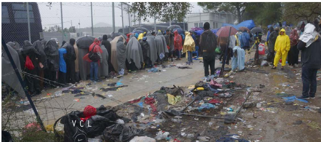
WAITING IN LINE, MORIA REGISTRATION CENTER.

“People are forced to stand in line for days on end exposed to rain, mud, and cold while suffering from exhaustion, fatigue, and malnourishment.”