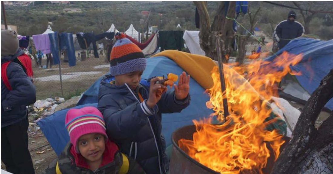
CHILDREN PLAYING AND KEEPING WARM, MORIA CAMP (NOW MORIA DETENTION CENTER).

As of October 2015, the increased number of arrivals and deteriorating weather conditions had dramatically worsened the situation at Moria camp. Nonstop rains and limited access to shelter meant refugees were fighting to survive in a wet, muddy environment without dry clothes, food, water, or medication. Despite the continued efforts of local people, national and international NGOs, and the United Nations High Commissioner for Refugees (UNHCR) to winterize shelters, condition remained critical. As of late March 2016, Moria continues to host more than 3,000 people, subject to the March 18, 2016, European-Union deal with Turkey.