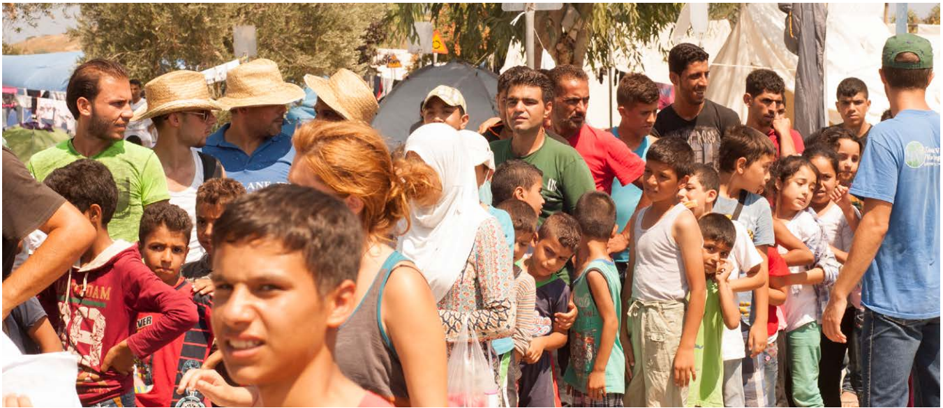
PEOPLE WAITING IN LINE FOR FOOD, KARA TEPE CAMP.

seeking shelter and protection from the elements. As the port became saturated, many refugees were forced to settle in the center of the city, in parks and squares, sleeping mostly under trees or on cardboard boxes, straining an already delicate relationship with locals trying themselves to cope with a changing city and the extent of the crisis.