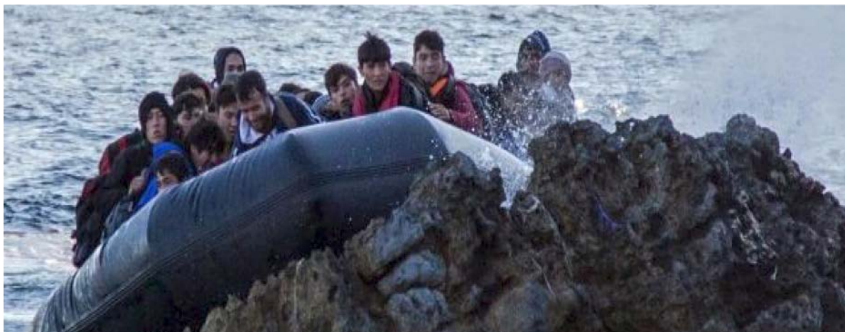
A BOAT CRASHES ON A REEF WHILE APPROACHING LESBOS.

“People described being aggressively forced to board boats under chaotic, disorganized, and terrifying conditions...”