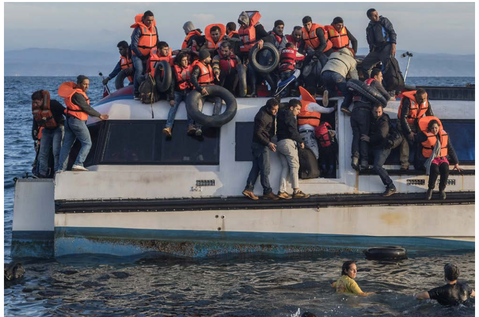
AN OVERCROWDED WOODEN BOAT IS RESCUED.

In the camps, locals routinely bring food and medicine and provide supplies or pledge their time working with the Social Kitchen “The Other Human.” Many migrants and refugees are surprised to learn that these people are volunteering their time and paying for supplies out of their own pockets, having assumed that these efforts were funded by the Greek or European governments.