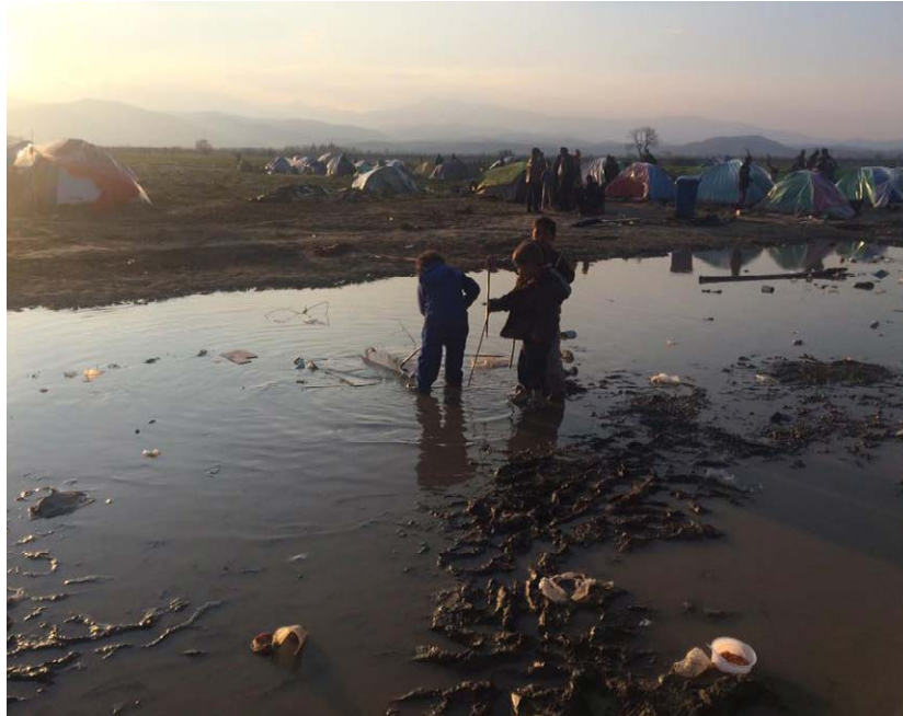
CHILDREN PASS THE TIME WHILE WAITING IN EIDOMENI.

Once reaching mainland Greece, refugees and migrants must pay more for ground transportation to reach the country's northern border to go to fYRoM and continue towards their destination countries. Those who provided testimony for this report said that their destination country is often based on the speed of asylum processing, the economic condition of the country, and whether they have family in those countries.