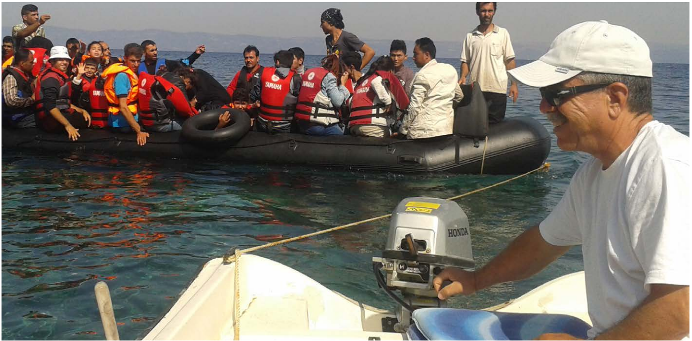
A LOCAL MAN PULLS A STRANDED BOAT TO SAFETY NEAR SKAMIA.