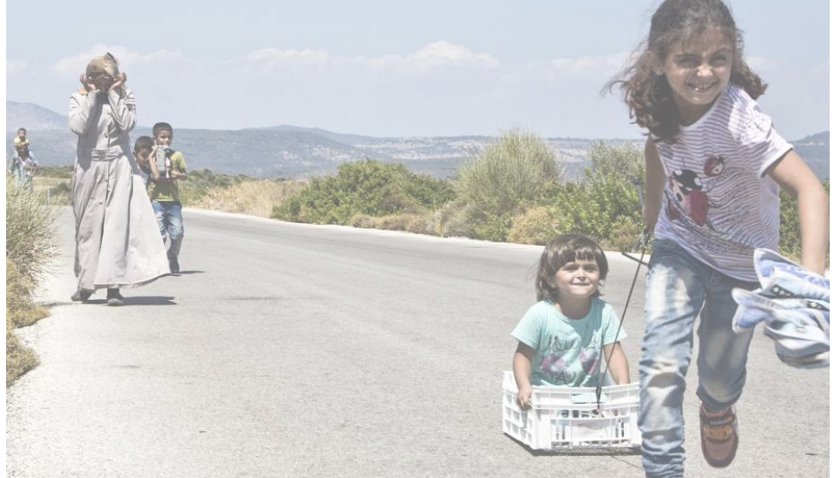
LATE AUGUST 2015: MIGRANTS WALK THE 30 TO 40 MILES FROM THE SHORELINE TO THE CAMPS.

The transportation of refugees by locals remains forbidden by law under the premise that doing so would equate to people-smuggling. Many of those inclined to help are further deterred by fines of up to Euro 150 and the threat of prosecution. During the summer, only in cases of emergency or injury were some transferred by ambulance or police to the local hospital.