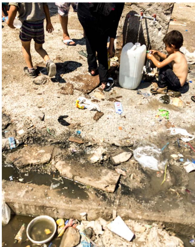
A CHILD REFILLS A WATER CONTAINER IN KARA TEPE CAMP.

Unfortunately, the rate of new arrivals quickly outpaced any potential for relief, causing already strained living conditions to deteriorate further. Despite efforts to construct a cleaning canal and to expand access to water and sanitation, it became clear that Kare Tepe camp, and Lesbos by extension, was unable to manage the crisis alone. As conditions grew worse, the distinct possibility of a public health disaster grew, with uncontrolled garbage accumulating close to water sources and unsanitary conditions increasing the risk of infections and diseases.