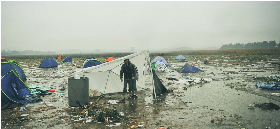
AD-HOC CAMP AT EIDOMENI.