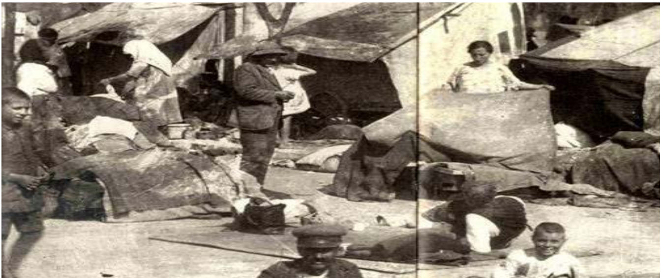
GREEK REFUGEE CAMP, LESBOS 1916.

Lesbos is the third largest island in Greece, located in the northeastern Aegean Sea, with a total population of 86,000 as of 2011. Its coastline stretches 199 miles, 80 of which face Turkey, and offers easy access to boats due to its sandy and smooth terrain. The closest point between Lesbos and the Turkish shores measures 6 miles, a distance that can be easily traversed by boat in 2 to 3 hours under favorable conditions.