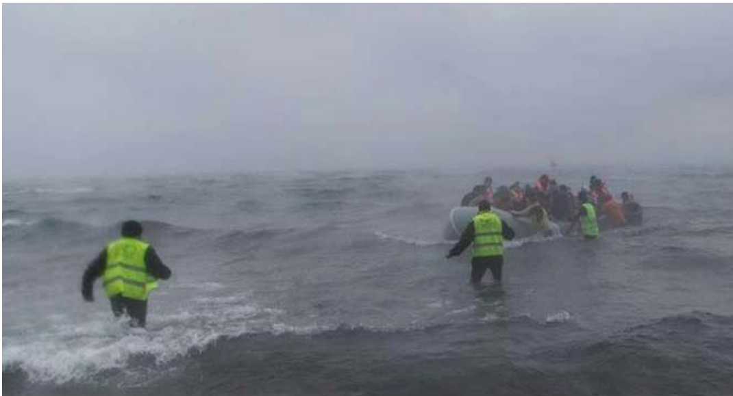
BOATS APPROACH LESBOS IN POOR WEATHER.